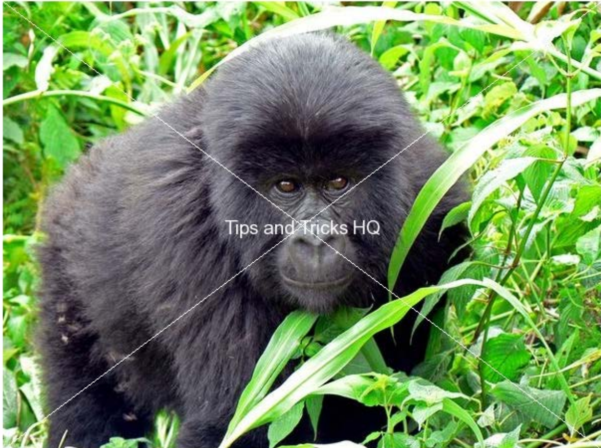
kwibesha-gorilla-vir_5897_600x450 Image 3 of 6

When someone opens an image from the gallery for a preview it will appear with the watermark text at the centre.