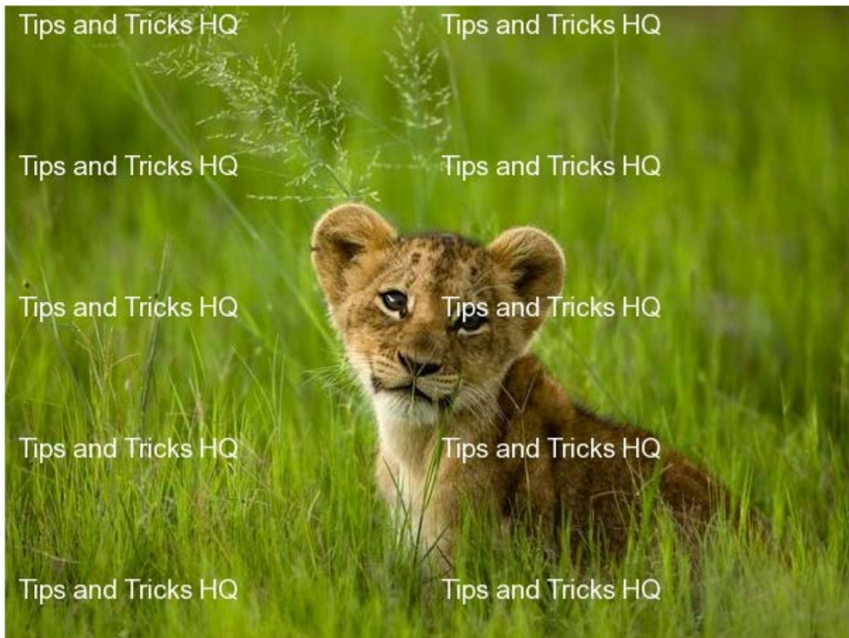
african-lion-cub-in-lush-grass_27527_600x450 Image 1 of 6

You can also change the Watermark text placement to “ Repeated Grid ”.